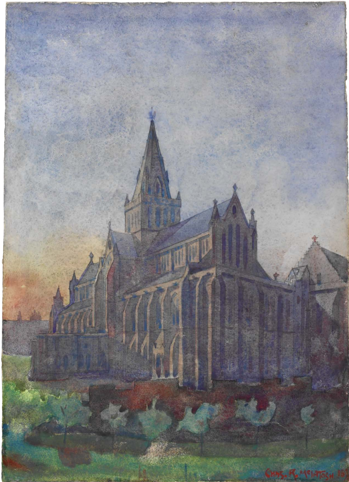
Glasgow Cathedral at Sunset (1890) – Charles Rennie Mackintosh